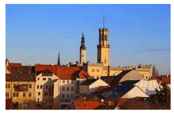
View of Görlitz